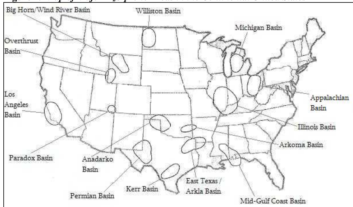
Figure 1. Map of Major H 2 S-prone Areas in the Continental United States 18

percent).” 17 Figure 1 illustrates the major H 2 S prone areas in the United States and identifies the basins.